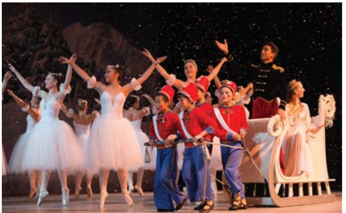
California Academy of Performing Arts performers from "The Nutcracker."